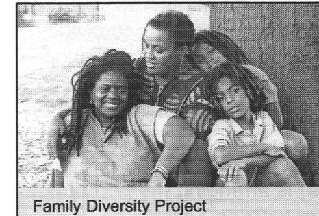
Family Diversity Project

OK2BME, K-W Counselling Services, Family and Children's Services of the Waterloo Region and Wilfrid Laurier University bring LOVE MAKES A FAMILY to Waterloo Region March 3-31, 2008.